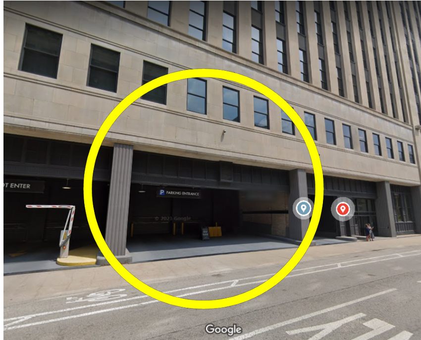
Entrance to Parking Garage

The Old Post Office features an on-site, indoor parking garage that allows you to park at your convenience. Located conveniently off of Harrison Street, guests enjoy direct access to our parking garage.